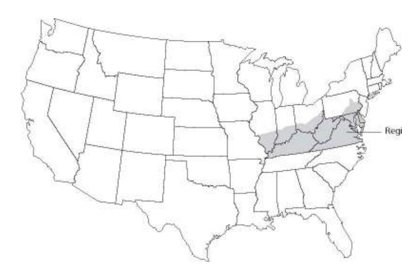
REGION 2 -Includes the following states or portion of states where Fomesafen 2 SL Herbicide may be applied: Delaware, Kentucky, Maryland, Virginia, West Virginia, South of Interstate 70 in the following states: Illinois, Indiana and Ohio and all areas South of Interstate 80 to the intersection of U.S. Highway 15 and East of U.S. Highway 15 and U.S. Highway 522 in Pennsylvania.