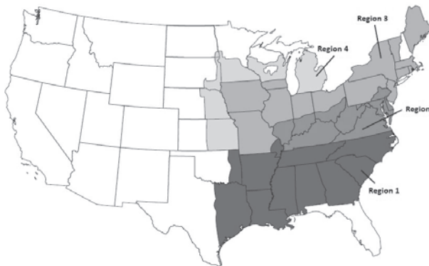
Regional Use Map

Region 1 (Maximum Rate 70 fl. oz. per Acre per Year): Includes the following states or portion of states where Forrest may be applied: Alabama, Arkansas, Georgia, Louisiana, Mississippi, Missouri (counties of Bellinger, Butler, Cape Girardeau, Dunklin, Madison, Mississippi, New Madrid, Pemiscot, Perry, Ripley, Scott, Stoddard and Wayne), North Carolina, Oklahoma (East of U.S. Highway 75 and East of Indian Nation Parkway), South Carolina, Tennessee, and Texas (includes area East of U.S. Highway 77 to State Road 239, including all of Calhoun County).