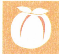
PEACHES, ALMONDS & STONE FRUITS