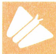
PEACH TWIG BORER