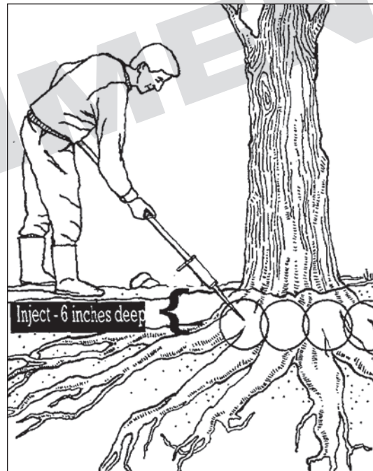
Figure 2. Placement of Travek 2 SC as a soil injected treatment